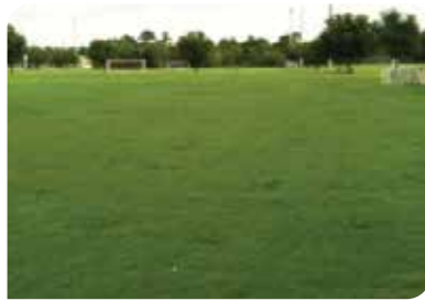
SEPTEMBER 1, 2011