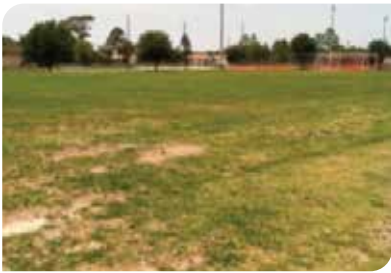
JUNE 1, 2011