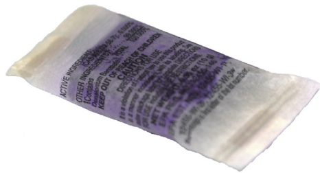
Photo may not be representative of a label-consistent bait placement