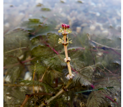
Eurasian Water Milfoil

FlumiGard™ Herbicide is powered by the active ingredient Flumioxazin, an N-phenylphthalimide herbicide. The mode of action in this chemistry family is inhibition of protoporphyrinogen oxidase (Protox), an enzyme important in the synthesis of chlorophyll. Formulated as a water dispersible granule, it contains 51% active ingredient of Flumioxazin.