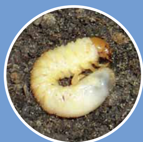
Grub infected with Milky Spore