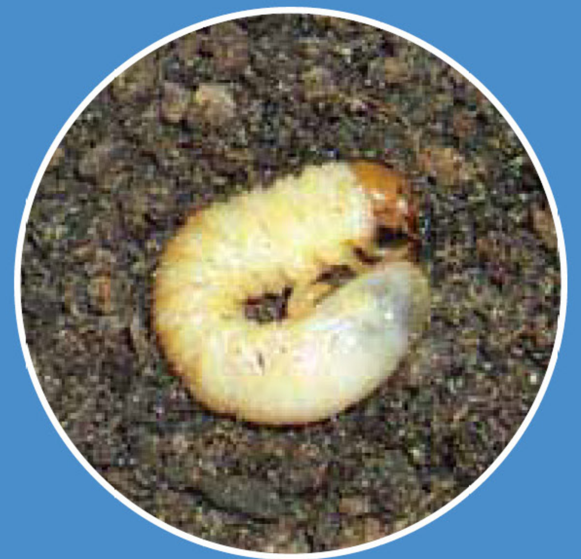
Grub infected with Milky Spore