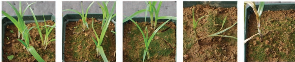
3 DAT Certainty® Herbicide 1.25 oz/acre