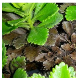
Rhizoctonia on Sedum (Phedimus phedimus)

(See label for complete list of diseases controlled.)