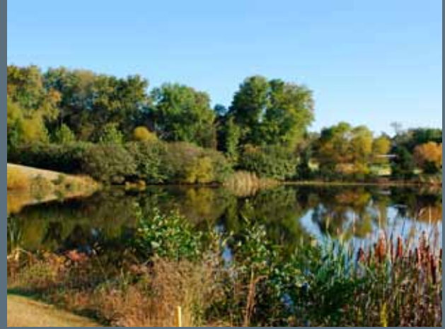
18 days after treatment with Clipper

“It looks like a miracle product for watermeal from what I’ve seen,” Tucker said.