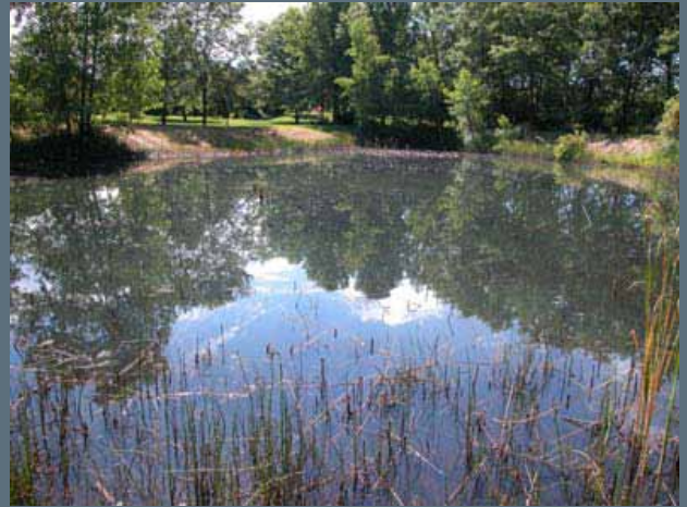
7 days after treatment with Clipper