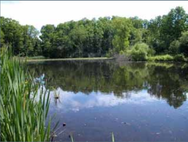
14 days after treatment with Clipper

Davis, meanwhile, said that “we have had a big problem with cabomba in our lake system over the years with limited success in controlling it. Flumioxazin consistently gave us excellent control in the EUP trials.”